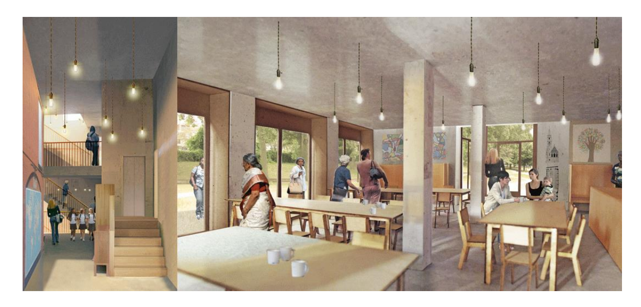
Figure 1: An illustration of what the new café could look like.